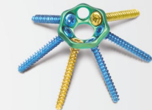
UHP for treating disorders of the distal radioulnar joint